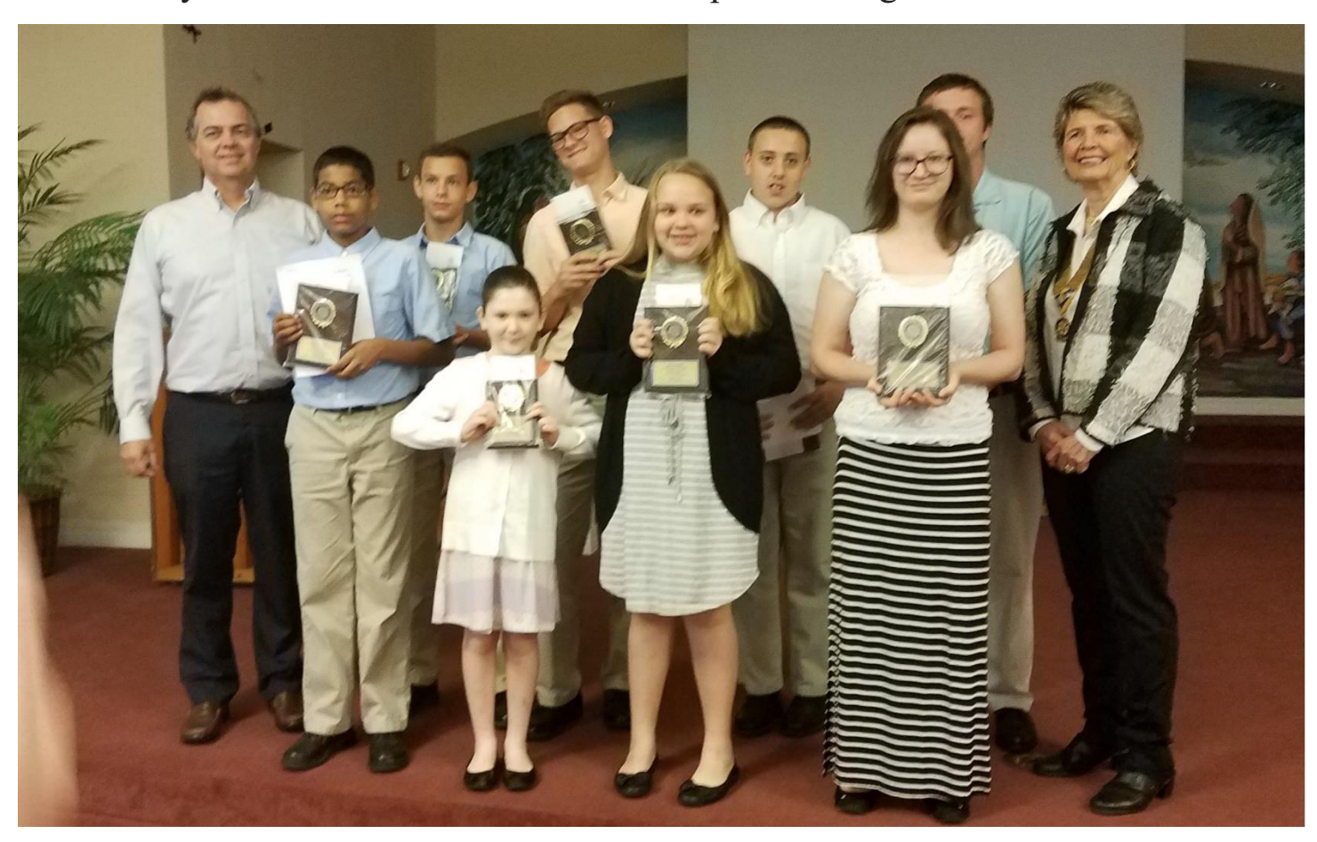
4 Way Test Contest Winners / Runner Ups from Thornebrooke Elementary 5^{th} Graders

4 Way Test Contest Winners / Runner Ups from Edgewood Children's Ranch