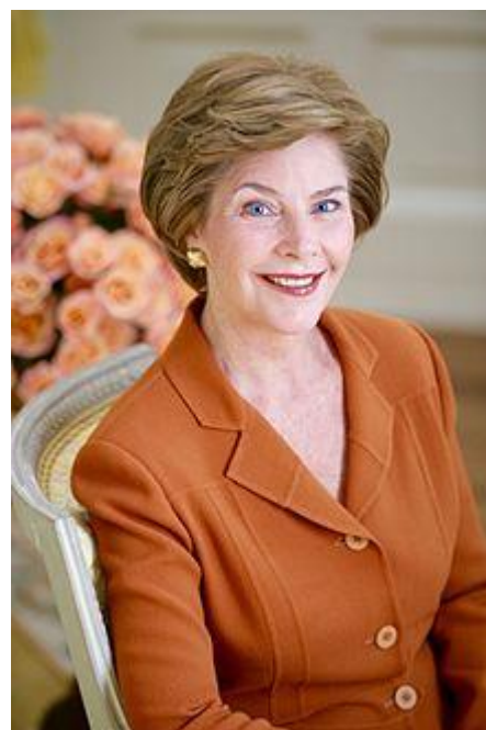
Guest Speaker Laura Bush