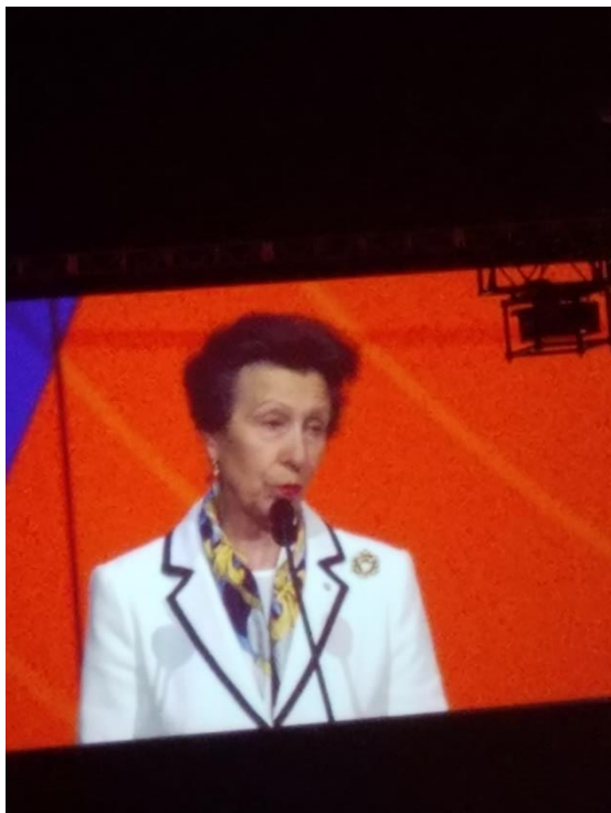
Guest Speaker Princess Anne