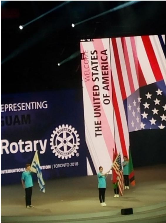
International Convention in Toronto