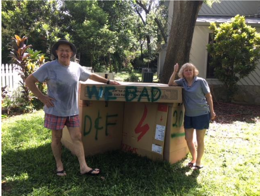
Water Balloon fight at Krens!