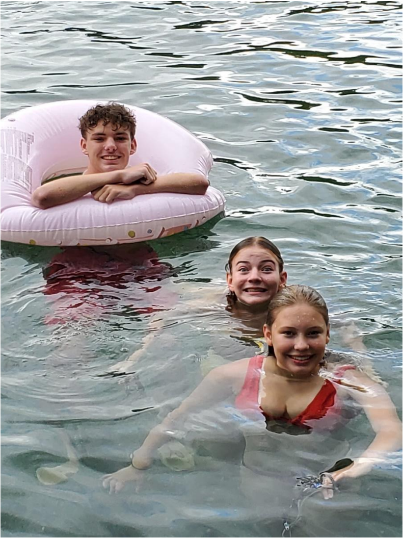
Our Texas granddaughters are still here enjoying the summer while our Tennessee grandsons are back in school full time.