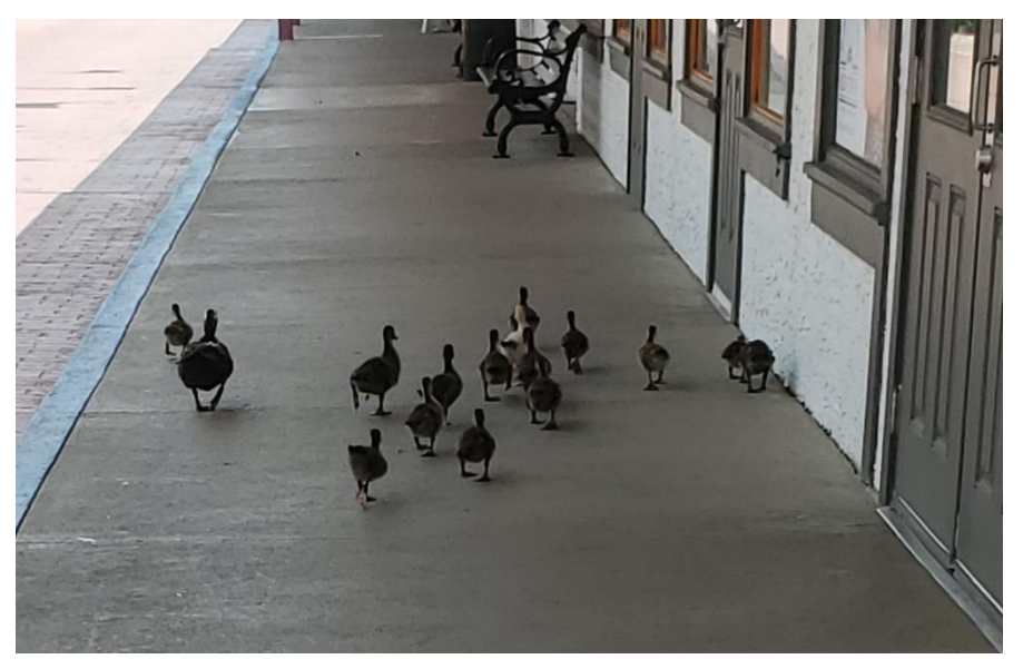
Mama duck and all her babies took a stroll through Old Town in front of the popcorn store!