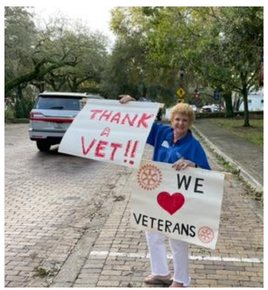
Rotarians at Work!