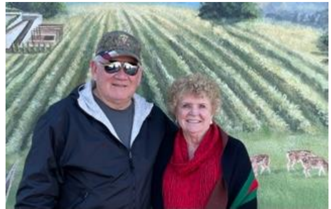
Johnson City, TX